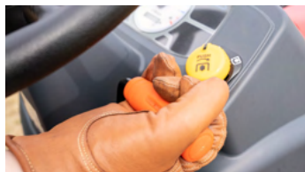
4. Throttle lever