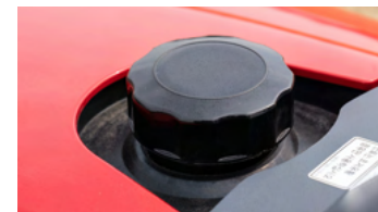
6. Large-volume fuel tank