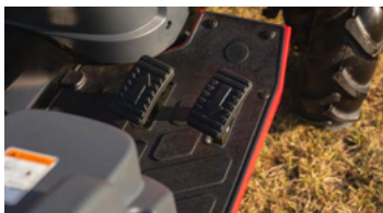
2. 2-range HST