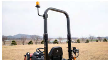
3. Foldable ROPS or all-weather cabin