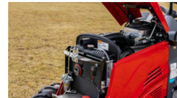
5. One-touch open hood