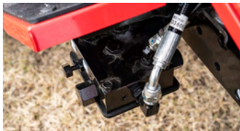
1. Linkage for optional loader