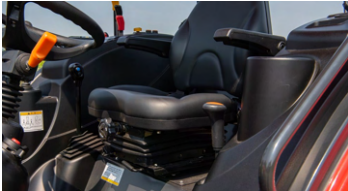
6. Comfortable suspension seat