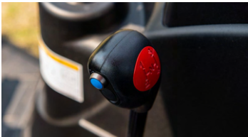
5. D clutch