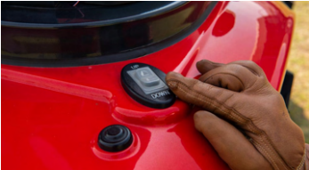
2. External hitch switch