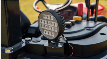
4. LED work light