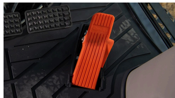
3. Electronic organ-type pedal