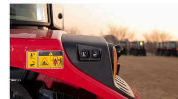
6. External hitch control buttons