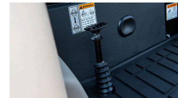
5. Differential lock system