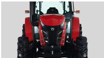
1. Tiger face front fascia