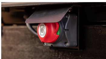
2. Battery shut-off switch