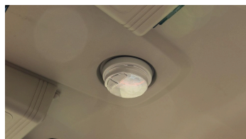
4. LED interior lighting