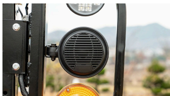
4. Waterproof Bluetooth speaker