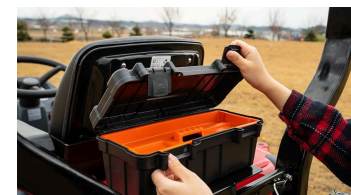
6. Wide loadspace with toolbox