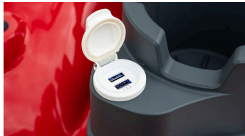
3. 2 USB ports