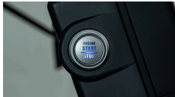
3. Push to start button