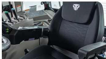
4. Adjustable suspension seat