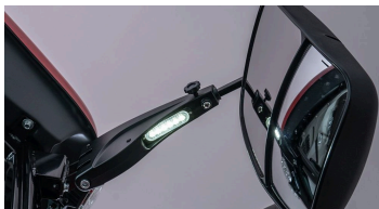
2. Sideview mirrors with LED