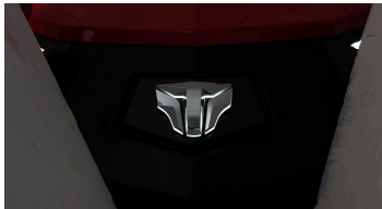
1. Backlit logo