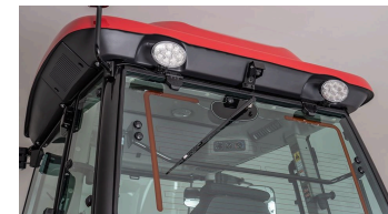
6. Heated rear window