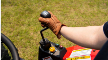
6. Joystick control for front-end loader