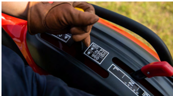
3. Ergonomic lever