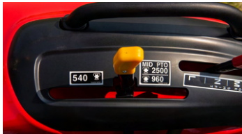
5. PTO lever