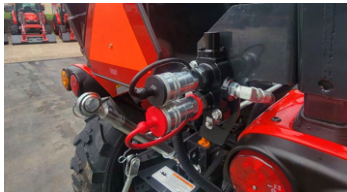
6. 2 port rear hydraulic control (optional)