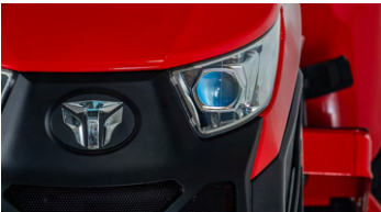
1. New iconic hood