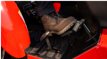
4. Responsive forward & reverse HST