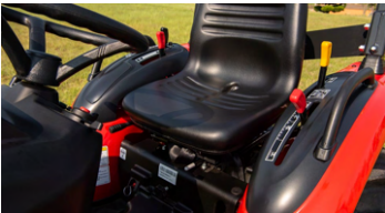
2. Comfortable suspension seat