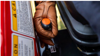
3. Ergonomic lever