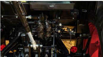
3. 2 sets of rear remote valves