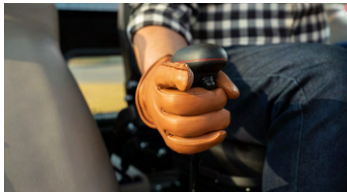
6. Joystick control for optional front-end loader