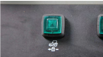
1. PTO cruise control