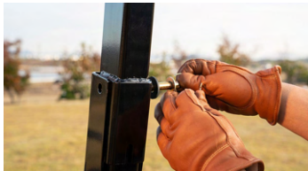
5. Foldable ROPS or all-season cab