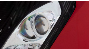
2. Projection head lamps