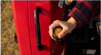
6. Joystick control for front loader