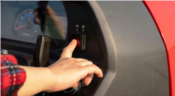
2. PTO on/off switch