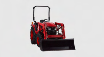
1. Optional loader with high lift capacity