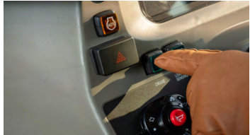
4. Cruise control