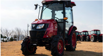
5. Foldable ROPS