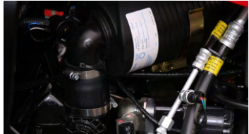
3. Dual filter air cleaner