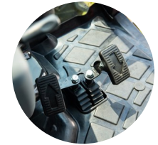
4. Highly responsive forward & reverse HST (5025CH)