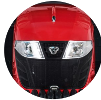
1. Hood design

High performance meets efficiency in this highly customizable Series 3 tractor that has the power to support your productivity.