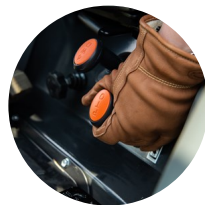
3. Ergonomic lever