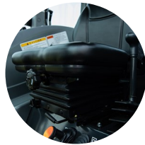
2. Comfortable suspension seat