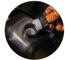
5. High-capacity fuel tank