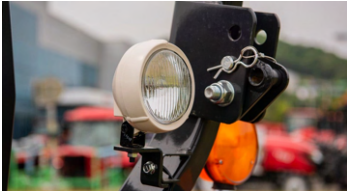
4. Rear work light