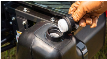
5. High-capacity fuel tank