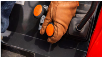
3. Ergonomic lever