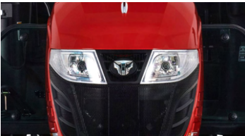
1. Hood design