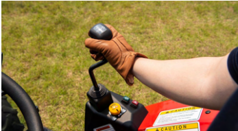
6. Joystick control for front-end loader