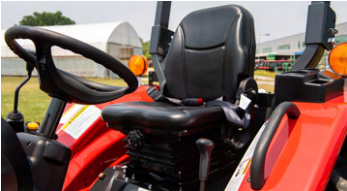
2. Comfortable suspension seat